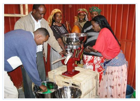
Figure 2. Cream separator for cheese production by a women group