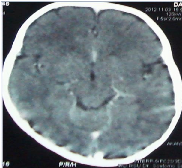
Figure 1: Head CT Scan showing cerebral edema and encephalitis

He presented with fever, stable hemodynamic and on the ventilator. Chest x-ray was supportive to pneumonia with granular spots. Blood and urine culture were sterile. Head Computed Tomography (CT) scan showed cerebral edema and encephalitis (Figure 1). Sputum specimen collected from the endotracheal tube showed alive Acanthamoeba in movements with pseudopods (Figure 2) with some transformed into cysts. Complete blood count showed white blood cell count of 21,190 cells/mcL, (Eosinophil 0.05%, Basophil 0.55%, Neutrophil 87.63%, Lymphocyte 7.98%, Monocyte 3.79%), hemoglobin of 9 g/dL, hematocrite of 27%, and platelet count of 136,500/mcL.