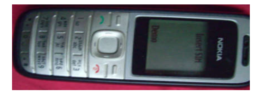
Figure- 1: Amharic Graphemes on a Mobile Keyboard

Dictionary preparation and use problems. The superfluous forms are said to be problems for dictionary preparation and use. In preparation, there is no way to determine which letter to be used to spell a word having initial letter with the superfluous ones. This means, ordering words in dictionary as an entry is difficult. Similarly, it will be difficult to search meanings and uses of words which are unsystematically arranged as entry due to the superfluous letters. The dictionary preparation problem has already been witnessed by Wolf Leslau (1976) in his Concise Amharic Dictionary as it is stated in his own words as follow: